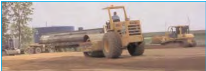
Excavation work was continuing on the new bulk fertilizer plant at the FCA Aurelia location as tons of dirt were being moved and sand was being hauled in to prepare the storage facility foundation.

and thus so much time in which so many things can happen, we have a solid foundation from which to build.